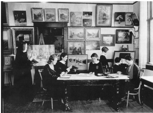
Aussi disponible en français!